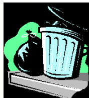
Make sure your trash and recycling doesn't blow down the street

Managing those March winds can be challenging – especially on trash day. It is amazing how trash days are windier than other days. Some residents have raised concerns about having to pick up light trash that has been blown out of the recycling bins. We contacted American Disposal for tips on how to keep trash in the bins.