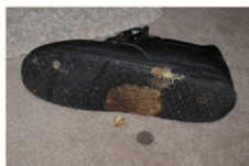
No one likes surprises when out walking their dog!

We have DOGIPOT® receptacles strategically placed around our community for your convenience, but if your dog defecates far away from one of these, you still need to pick it up. Longer and colder nights, distance from the DOGIPOTS® or not having a bag with you are